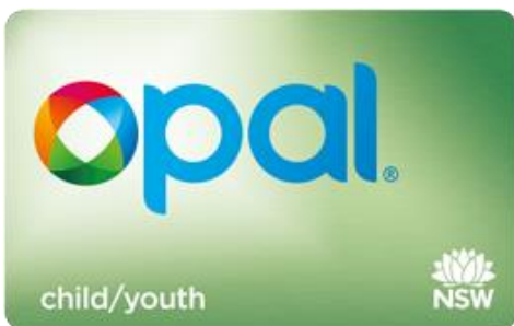
Under 16 years of age

NOTE: International students under 16 are eligible for a child/youth Opal Card. Students who are 16+ must travel with an adult Opal Card. You can purchase one from a newsagency or 7/11