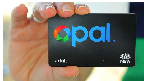
16 + years old