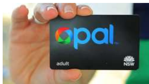
16 + years old