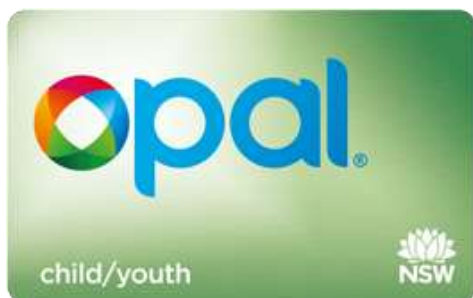
Under 16 years of age

NOTE: International students under 16 are eligible for a child/youth Opal Card. Students who are 16+ must travel with an adult Opal Card. You can purchase one from a newsagency or 7/11.