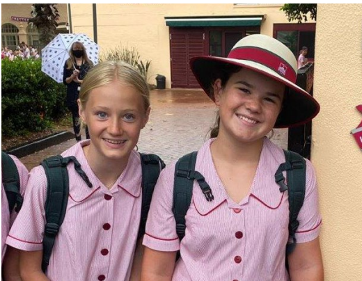
Optional College hat already making its way onto some Year 7 heads!