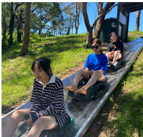
Girls at Jamberoo

Our International students who are overseas were also able to experience something from Australia over the summer holidays, with Christmas gifts organised and sent by the College. We are hoping they can come back soon!