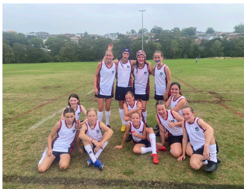
The AFL team goofing around after a great win!

Congratulations to our Years 7 and 8 AFL team who have qualified for the grand final of the Independent Schools Competition! Our team have had a great season and will play against Abbotsleigh at PLC this Saturday. Well done team on making the Grand Final and best of luck this weekend!