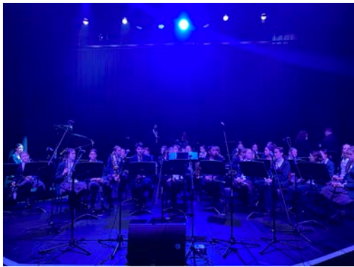
Photo Gallery - Music Night