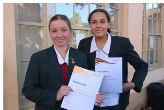
Congratulations to our recent Bronze Award recipients.