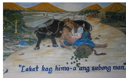
The Good Samaritan Parable mural at the Kinder school.

It was an insightful immersion, eye-opening and heart-warming and great to actually see where all the money raised throughout this year, particularly from the Sleep Out in September is making a big difference to a community in genuine need.