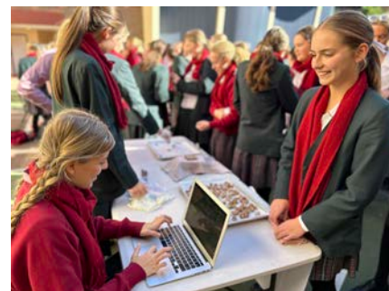
Photo Gallery Year 11 Business Studies