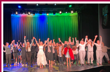
Photo Gallery Drama Night