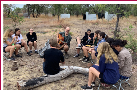
Photo Gallery Red Earth Immersion